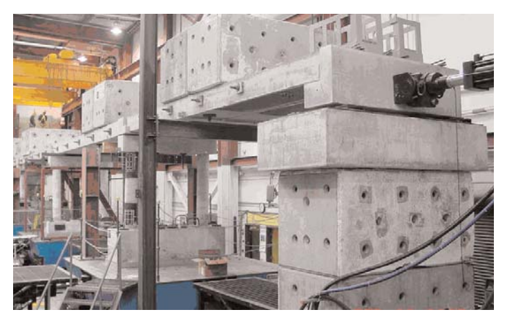
Model bridge tested at UNR NEES facility, February 2007.

Over the next two years, the researchers plan to test two more bridge models that incorporate innovative seismic-resistant features. Reinforced-concrete piers will be strengthened with outer layers made from fiber-reinforced polymer composites; columns will be made more resilient with built-in isolators designed to absorb and damp down seismic forces; and column-footing connections will be toughened with new "superelastic" nickel titanium rods and bendable concrete.