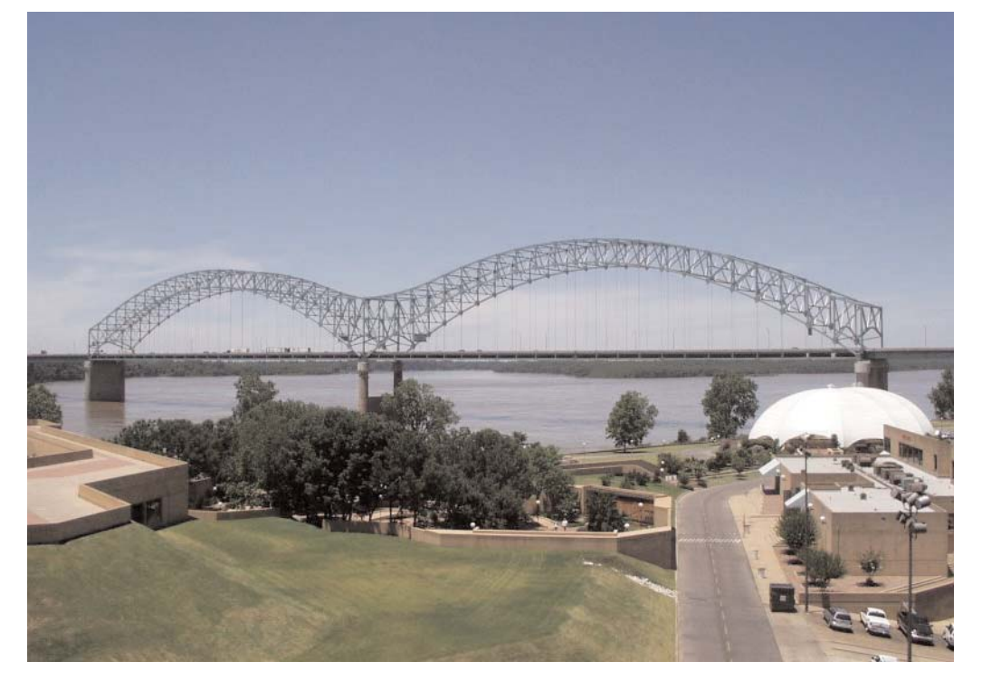
I-40 bridge at Memphis.

ground level and at depths of 100 and 200 feet. This equipment was funded by TDOT and ANSS. CERI is maintaining the entire bridge monitoring system, and expects to begin receiving data from the reference sensors in real time later this spring.