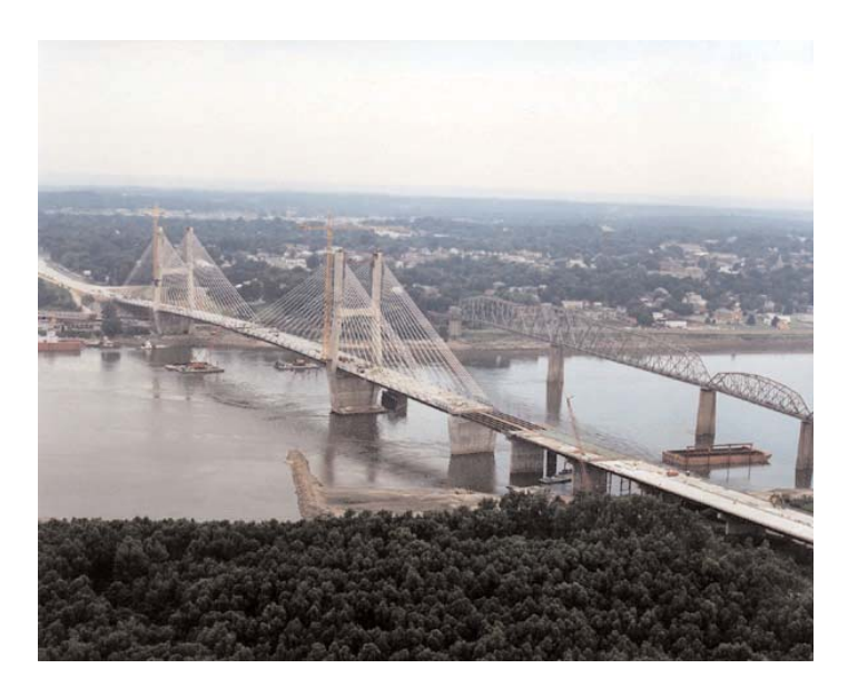
Emerson bridge nears completion in 2003 (bridge in the background has since been demolished).

In 2007, a state-of-the-art geotechnical ground-failure instrumentation array was added to the monitoring system. This work was designed and implemented by researchers from the University of Illinois at Urbana-Champaign under a grant from the USGS Advanced National Seismic System (ANSS). Earlier studies had found that the floodplain under the eastern portion of the bridge includes a layer of sandy soil approximately 40 feet thick that is susceptible to liquefaction during a significant earthquake. This additional array, consisting of piezometers that measure water pressure in soil and micromachined electromechanical sensor-based systems that measure soil vibrations and displacements, was designed to record dynamic soil behavior and its effects on the bridge. Of particular interest was soil in the approach embankment on the Illinois side of the bridge, which the Illinois Department of Transportation had modified to mitigate liquefaction.